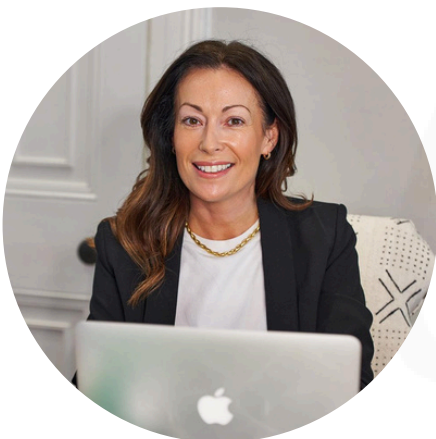
Ref: Brood Magazine

"The learning was just amazing. The knowledge and the lessons that we got given that was really impeccable and make me feel really empowered."